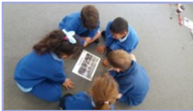
Working with St John

Kia Ora, Talofa Lava, Ni Hao, Malo e lelei, Fakalofa Lahi Atu, Kia Orana, Salaam, Bula Vinaka, Sabai de, Namaste,