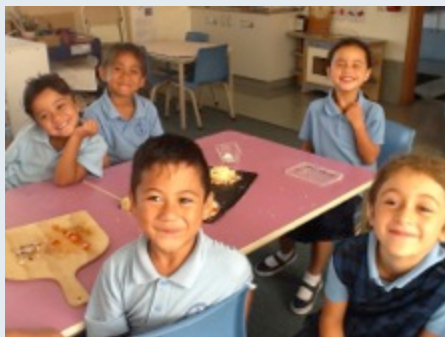
Making Pizza in Room 9